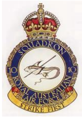
Sunderland Mk I - 230 Sq RAF