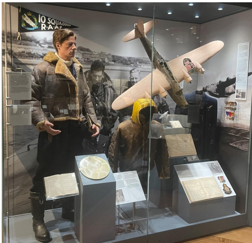
The Coastal Command Display

I was pleasantly surprised to be able to visit the newly opened Coastal Command Display which features memorabilia from 10 Sqn and 461 Sqn