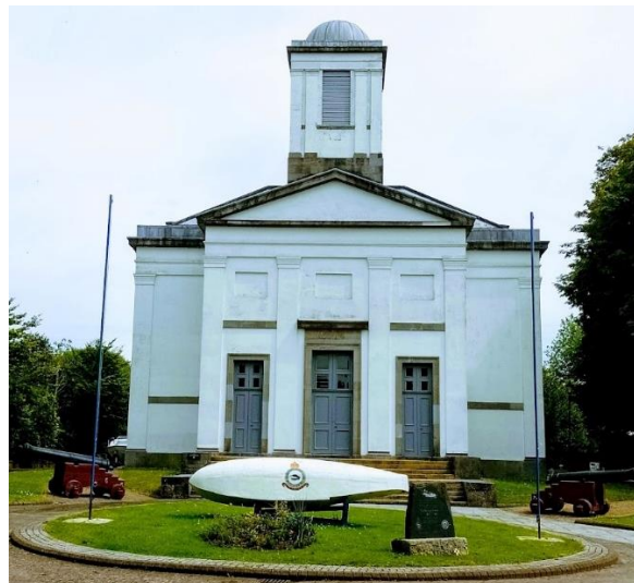
Pembroke Dock Heritage Centre located in the Chapel of the RAF Base