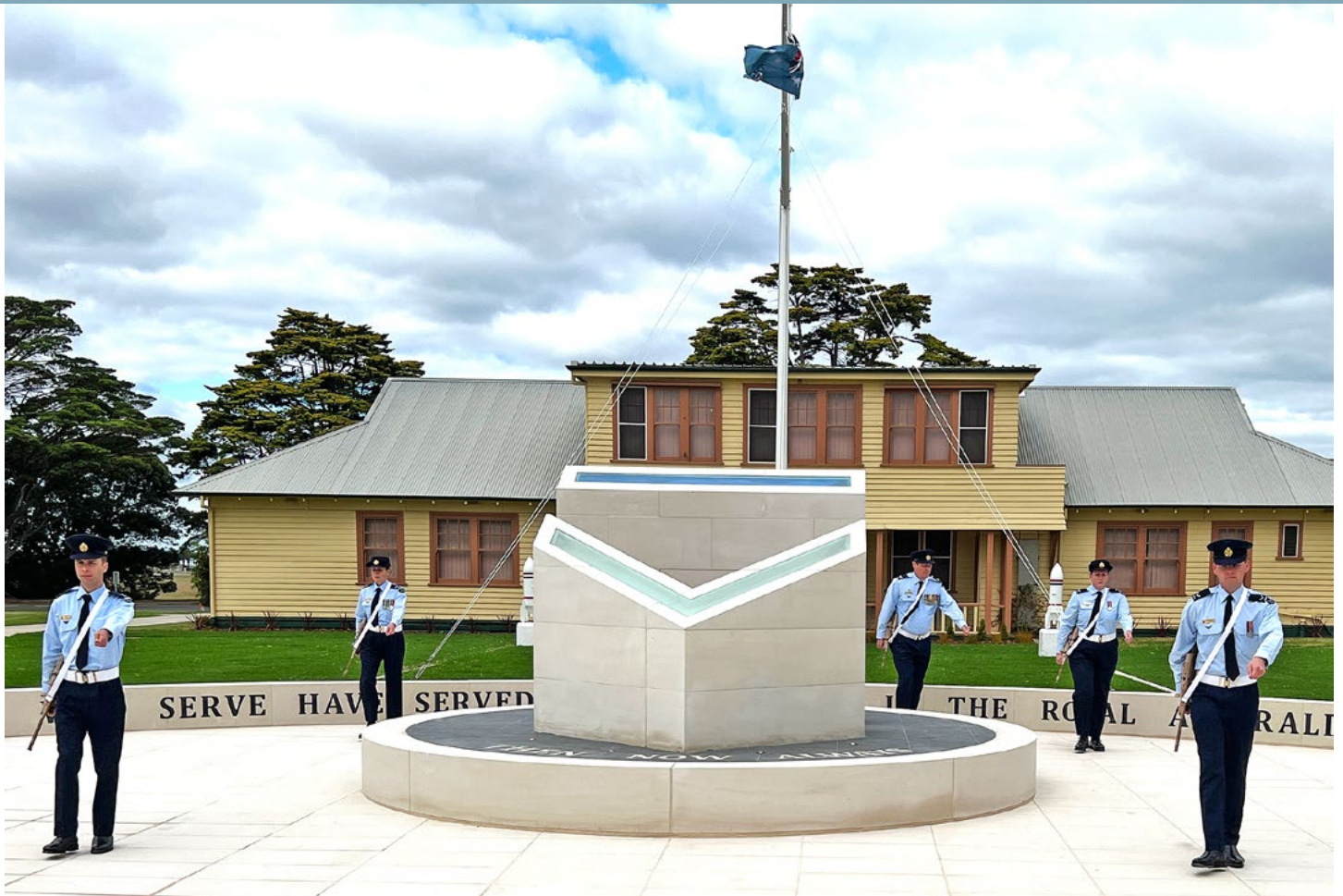
Mounting of the Catafalque Party at the dedication ceremony for the Air Force Centenary Memorial.

“FOR ALL WHO SERVE, HAVE SERVED AND WILL SERVE IN THE ROYAL AUSTRALIAN AIR FORCE. THEN. NOW. ALWAYS.”