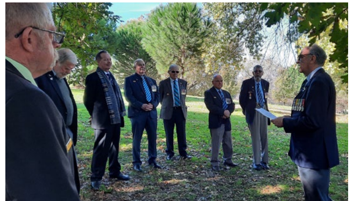
Following the March, the RAAF Vietnam Veterans gathered at their RAAF Vietnam Vets plaque adjacent to the Shrine for reflection and wreath laying.