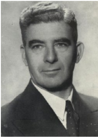
In later life