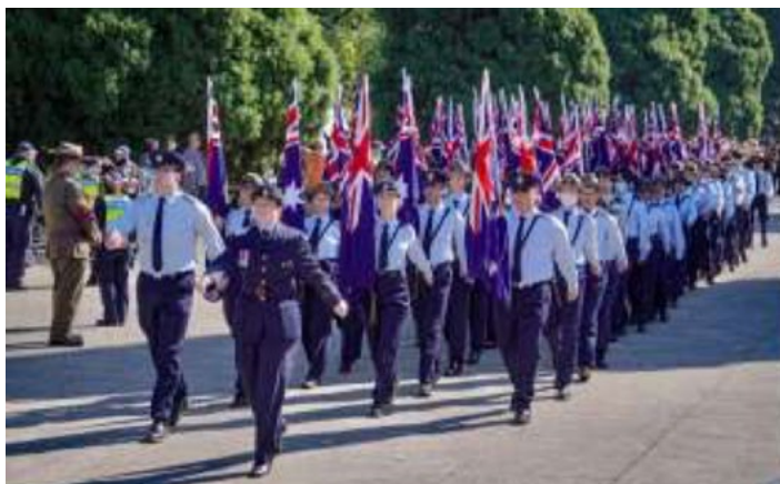
Air Cadets bringing up the rear with a massed Australian National Flags (ANF) body on ANZAC Day