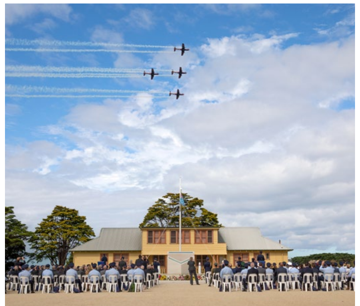
Roulettes conduct their flypast during the Air Force Centenary Memorial dedication ceremony at RAAF Base Point Cook.