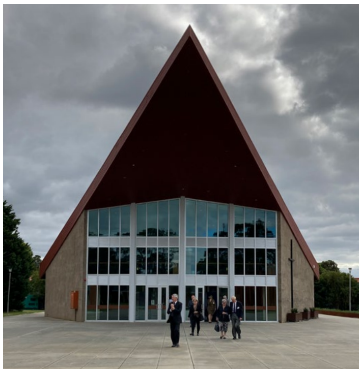
The Chapel of the Holy Trinity at RAAF Base Point Cook