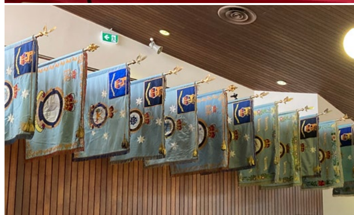
The Chapel has been the safekeeping of the RAAF's laid up colours including those Queen's colours, banners and Squadron Standards which have been replaced, or from units which have been disbanded.