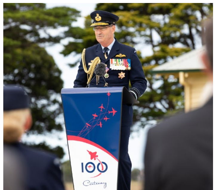
Chief of Air Force, Air Marshal Mel Hupfeld, AO DSC, addresses guests during the Air Force Centenary Memorial dedication ceremony at RAAF Base Point Cook