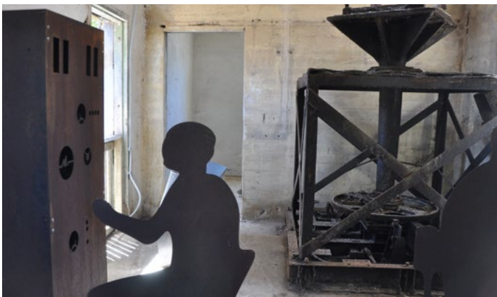
Inside - Radar Operator with radar receiving equipment and original Radar Arial or Array Turning Gear.