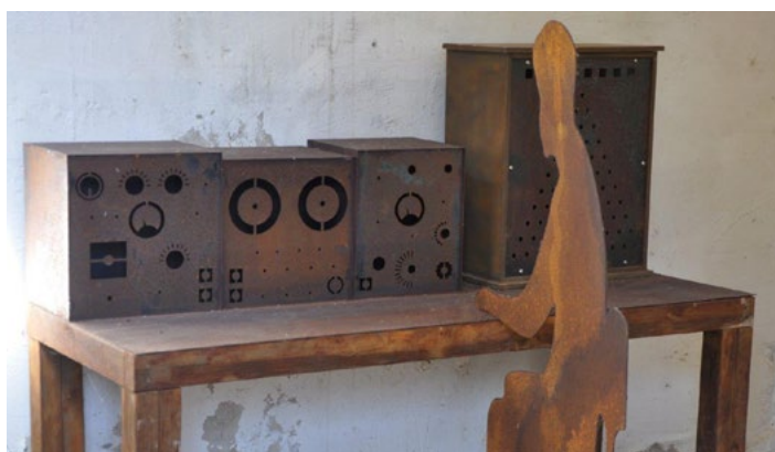
Inside - Radar Mechanic with radar W/T equipment