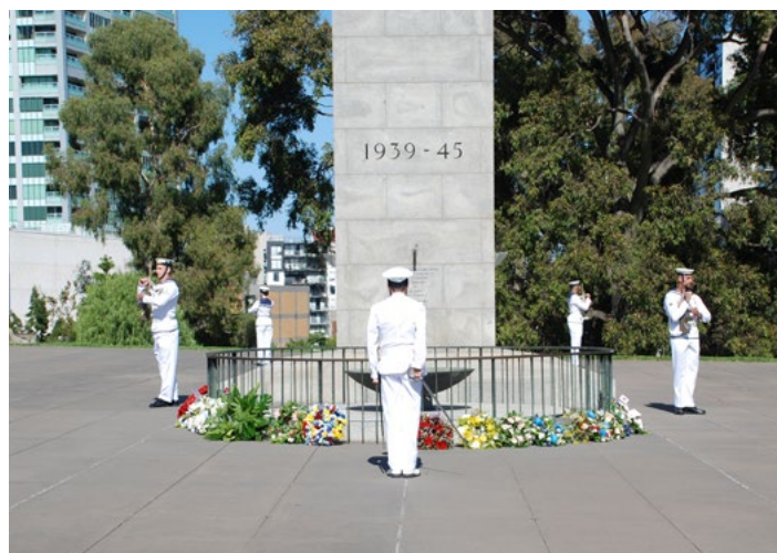
The HMAS Cerberus Catafalque Party