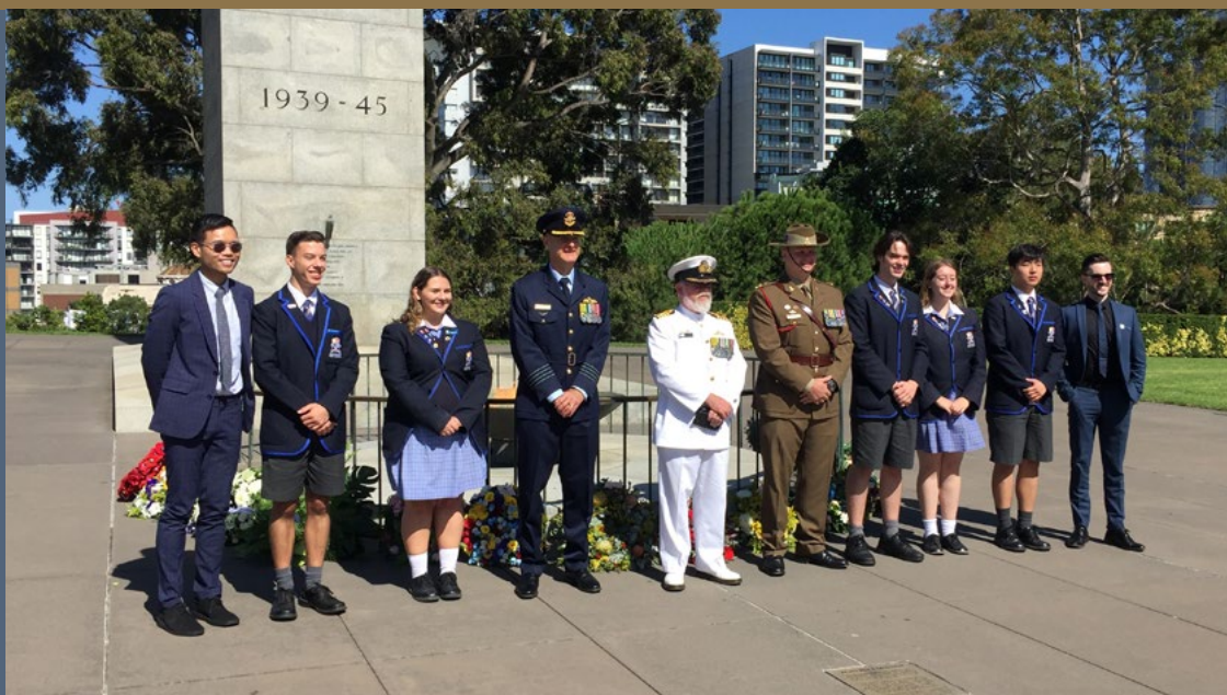
Wreaths were laid by representatives from Government, consulates, schools and the ex-service community.