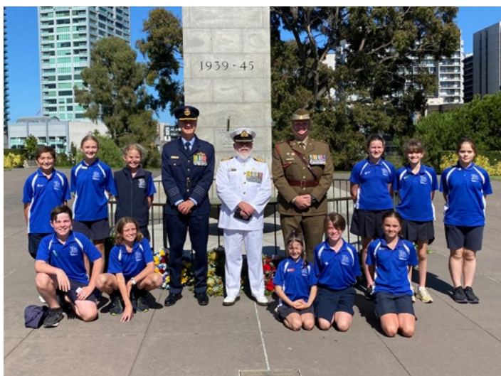
Puckapunyal Primary School students attended the Commemoration.