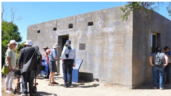
RAAF Radar Exhibition-12RS Cape Otway (Current status)