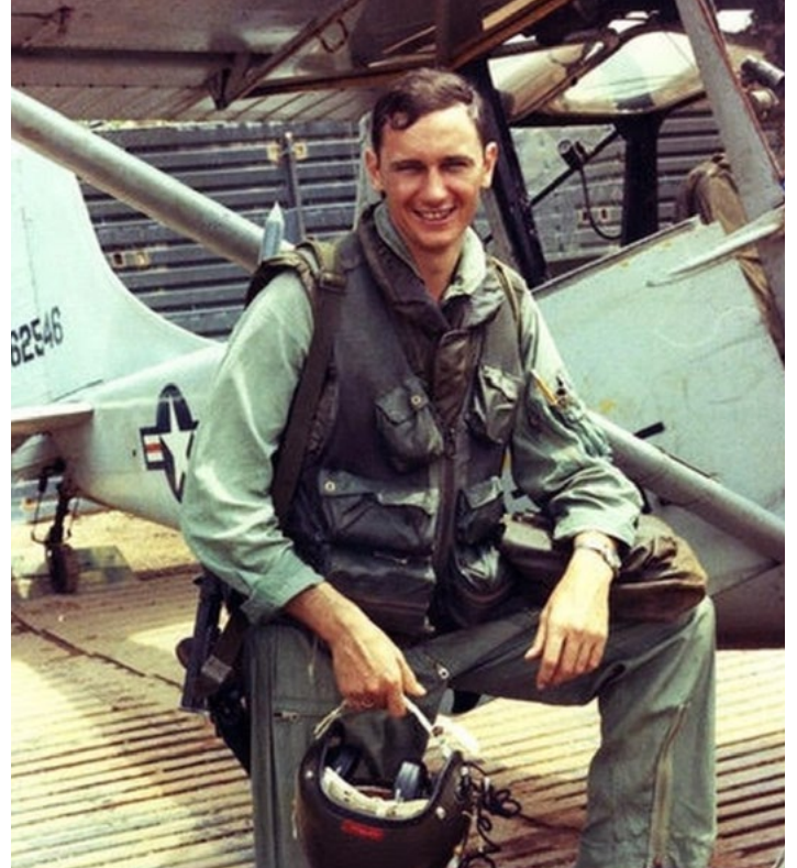
In Vietnam, 1968.