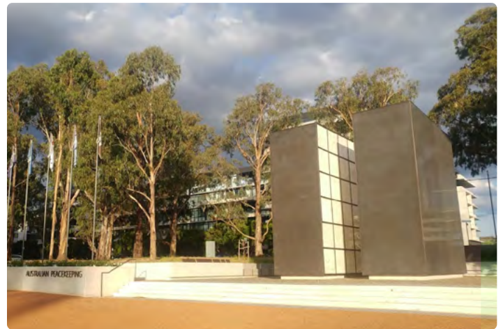
The Australian Peacekeeping Memorial on Anzac Parade in Canberra commemorates the significant contribution made 'in the service of peace' by more than 80,000 Australian peacekeepers – military, police and civilian – to more than 60 United Nations and other international peacekeeping missions since 1947.