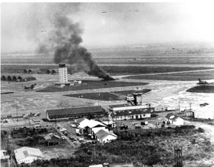
A Vietnamese Air Force Lockheed C-130A Hercules burns at Tan Son Nhut air base, Vietnam, after a North Vietnamese rocket attack on 29 April 1975. This attack forced the U.S. to cancel further evacuations by fixed-wing aircraft.