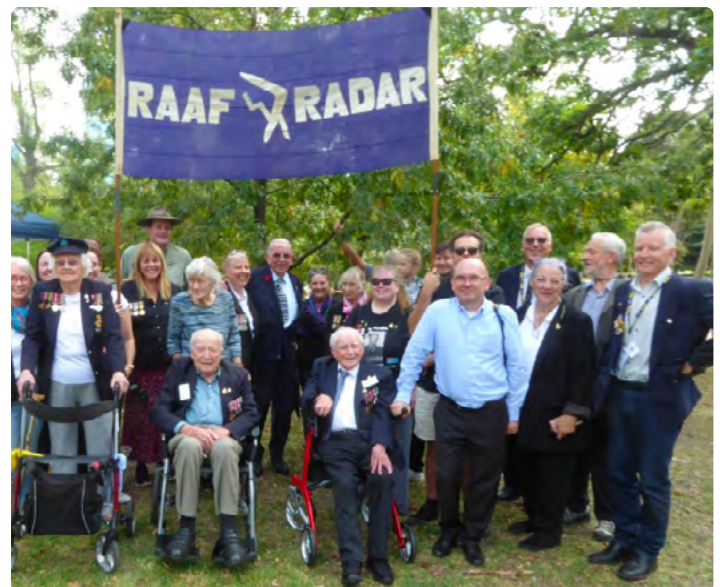
RAAF Radar members and family gather for ANZAC Day.

Radar Mechanic, was one of 12 WWII vets invited by the Department of Veteran Affairs to attend the commemoration service at