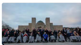
WWII veterans join the Governor General, Her Excellency the Honourable Ms Sam Mostyn and the Minister for Veterans Affairs, The Hon. Matt Keogh MP, to observe the flypast commemorating the 80th anniversary of the end of WWII.