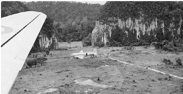
An RAAF Dakota aircraft dropping supplies by parachute over a police post in a clearing in the Malayan jungle. No 38 Squadron RAAF provided transport and support operations for British Commonwealth forces during the Malayan Emergency. The reliability and relatively slow speed of the Dakota meant that it was an ideal aircraft for these operations. During World War II, RAAF and United States Dakotas had carried out similar operations in support of Australian soldiers in New Guinea.