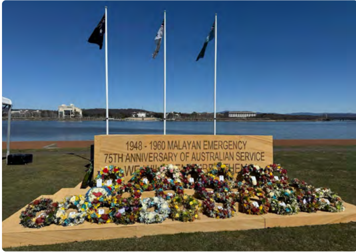
The Malayan Emergency Commemoration was held on the foreshore of Lake Burley Griffin in Canberra on 31 August.

The 75th anniversary of Australian service in the Malayan Emergency (1948–1960) and Indonesian Confrontation (1962–1966) was marked with a National Commemorative Service in Canberra on 31 August, to acknowledge those who served and to remember the 61 Australians who lost their lives in these conflicts.