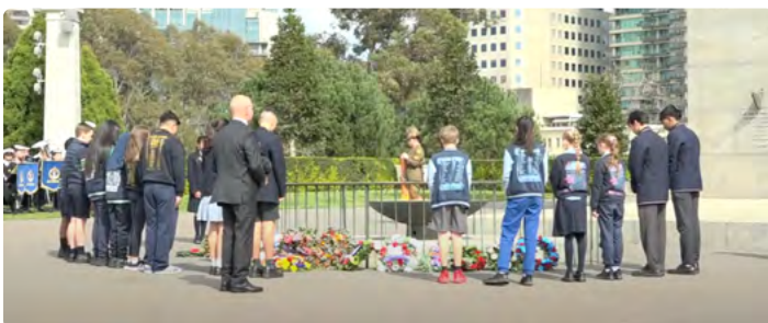
Students and invited guest laid wreaths at the Eternal Flame in honour of the service and sacrifice of Australians and their allies.