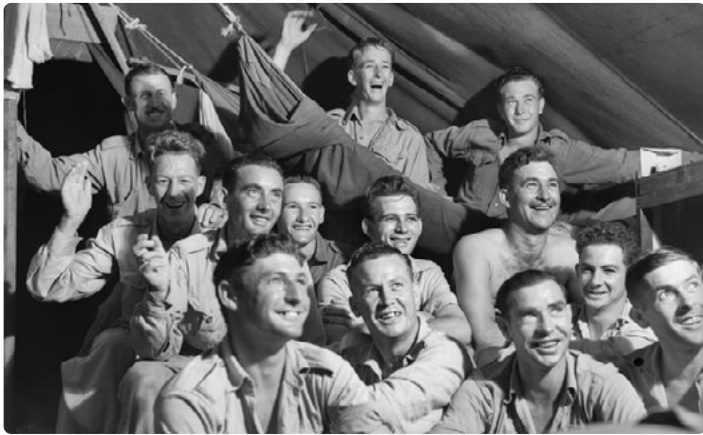
Members of the RAAF listen to radio broadcasts announcing the surrender of Japan – Labuan, North Borneo, 15 August 1945.