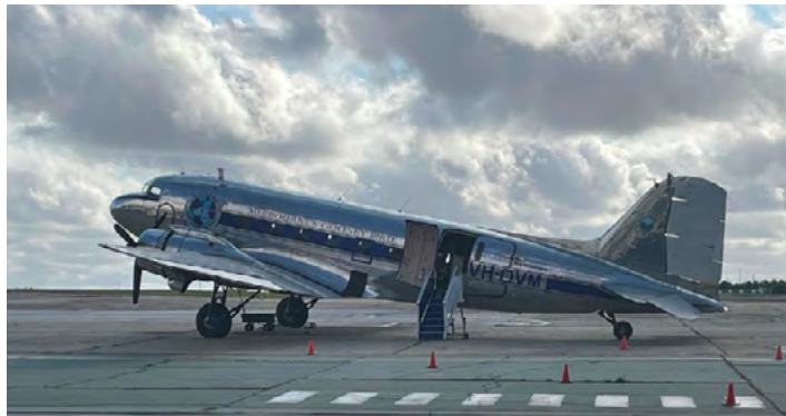
The “Gooney Bird” DC-3 was a popular attraction at Ballarat Heritage Week.

With a tight timeline leading up to the event, Ballarat Council, the Air Force Association Ballarat and the Commercial Manager of the aerodrome worked to provide an event at the airport celebrating its history. It was determined that the headline act would be the chartering of the “Gooney Bird” DC-3 bringing aviation enthusiasts out of Essendon Airport.