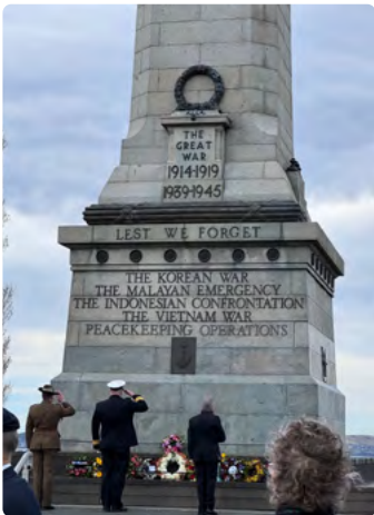
Members of the Australian Defence Force, RAAF Association, guests and representatives from Allied and Axis powers prepare for the wreath laying ceremony at the cenotaph in Hobart

Veterans, serving Air Force personnel and families of 'The Few' gathered in Hobart on 12–14 September to mark the 85th anniversary of the Battle of Britain, the pivotal World War II air campaign that halted Nazi Germany's invasion plans for the United Kingdom.