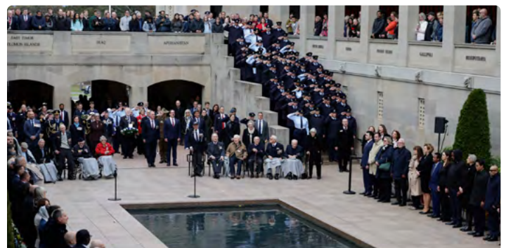
WWII veterans are honoured at the special Last Post Ceremony at the Australian War Memorial, commemorating the 80th anniversary of the end of WWII.