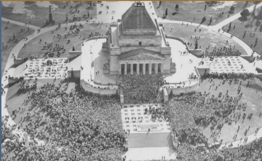
Crowds gather at the Shrine of Remembrance in Melbourne to celebrate Victory in the Pacific, August 1945.