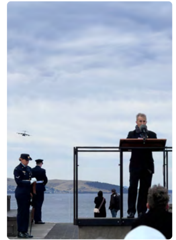
Air Force Association National President, AVM Joe Iervasi AM CSC delivers his occasional address as a RAAF C-17A Globemaster III approaches for its flypast