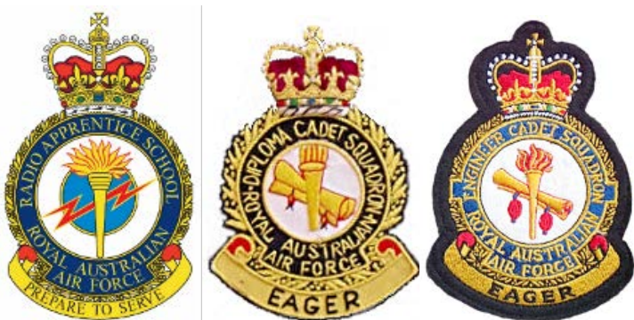
The Crests of the Best - Apprentice School, Diploma Cadets and Engineer Cadets

This period saw a significant expansion of the collaboration of RMIT in the academic education of some 700 RAAF personnel in the disciplines of Aeronautical, Communication, and Mechanical Engineering and in Business Studies. They were home based at the RAAF's Diploma Cadet Squadron (DCS), later becoming the Engineer Cadet Squadron (ECS) at Frognall, Camberwell. Some of these personnel included graduates from the