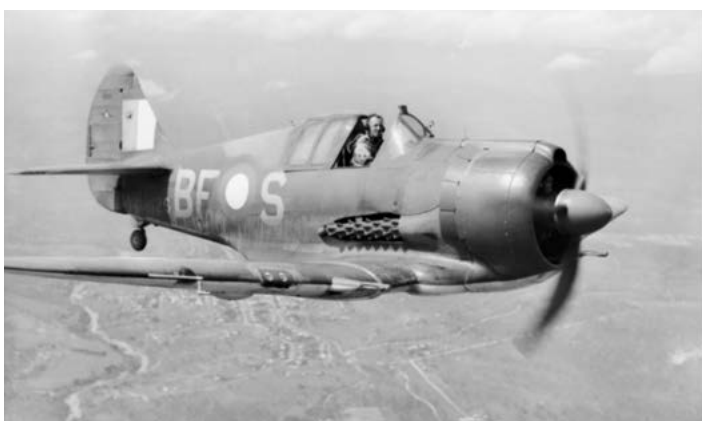
CAC Boomerang in 1944

“VP Day represented the end of hostilities and a conflagration that had taken 70 million lives; 3% of the world’s population at that time died during the Second World War. One half of those casualties were suffered in the Pacific. Australia lost 17,701 war dead in the Pacific alone.