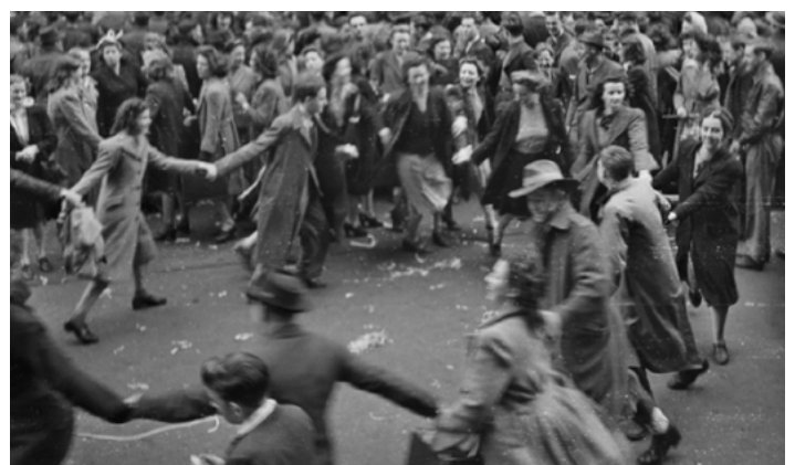
Victory in the Pacific – Melbourne celebrates in 1945 (image courtesy AWM).