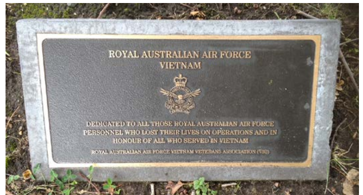
The RAAF Vietnam Veterans' plaque adjacent to the Shrine of Remembrance

In view of the cancellation of the main commemorative event, the Vietnam Veterans' Branch of AFA Victoria is looking ahead to later in the year (possibly 19th November - to commemorate the 50th anniversary of the cessation of combat missions by 9 SQN). With increased vaccinations and a reduction in State Government lockdowns, there may be an opportunity to hold a short Commemorative Service followed by a gathering of Branch members for our annual lunch.