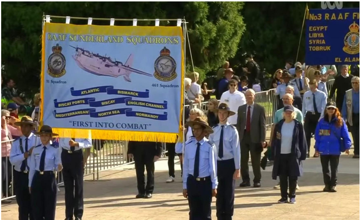
Held up on the Shrine Forecourt

We formed up in Flinders Street East and were accompanied by our own band for the march., The Air Force Cadets once again did a great and much appreciated job as the banner bearers.