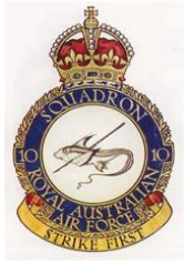
Sunderland Mk I - 230 Sq RAF