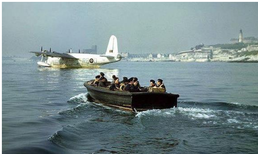
A 10 Squadron Crew on their way out to the kite RB-D at Mt Batten. [RB-D possibly N9050]

We now have both 10 and 461 Squadron Plaques in stock. The cost is $70.00 including GST, postage and packaging.