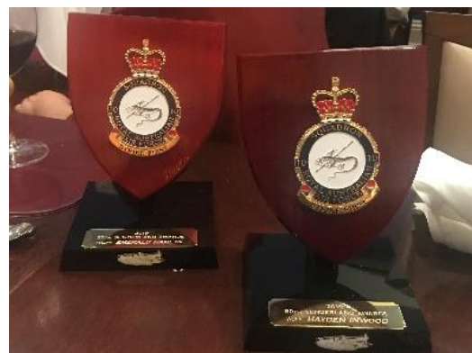
Award Winners' Trophies