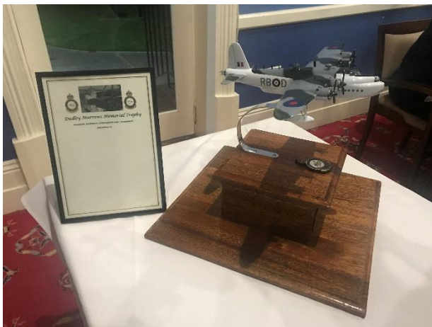
The Dudley Marrows Memorial Trophy

It has been decided that moving forward that there will be a change in the format for future awards. There is to be a single annual award to be known as "The Dudley Marrows Memorial Trophy" and presented to a 10 Squadron member who displays the characteristics of Courage, Integrity, Compassion and Leadership.