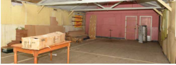
BEFORE: Airport Hut 48 as it was left 50 years ago.