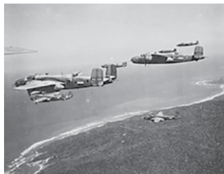
B25 Bombers over northern Australia

The Mitchells were stripped of their armaments and converted to transports in order to be used as air