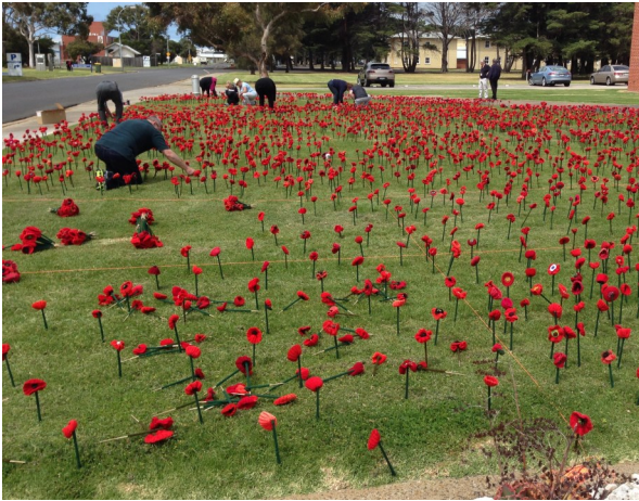
Team preparing the field of Pop's