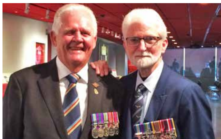
(Top) A very moving NMBVAA Commemorative Service at the beautiful Shrine of Remembrance