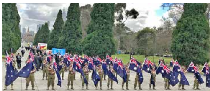
26 Australian flag-bearing Army cadets from Mentone Grammar School, representing the 26 Diggers killed-in-action during the Coral and Balmoral battles.