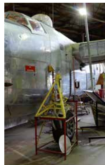
The B24 Liberator – restoration well underway!

In our last edition of Contact, we brought you Part 1 of the story of the restoration of Australia's only surviving B-24 Liberator, one of only eight still in existence in the world.