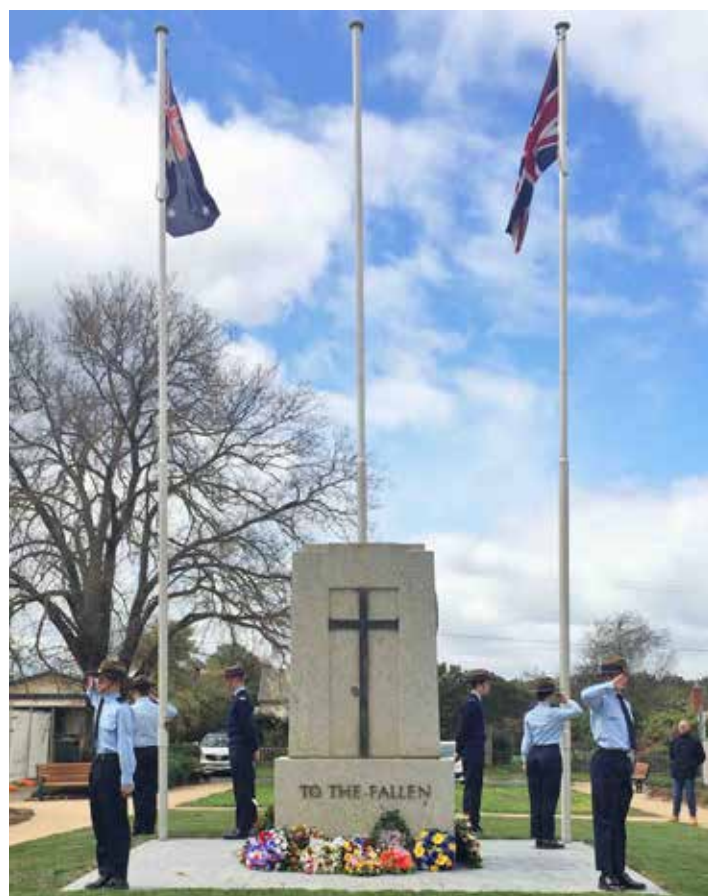
The Battle of Britain memorial service at the Sebastopol Memorial in Ballarat

Just a little bit of rain during the ceremony but not enough to dampen the spirit of the occasion or stop the fly overs by the vintage Auster aircraft which added to the occasion. Lovely to see the fine upstanding young people of 425 Squadron