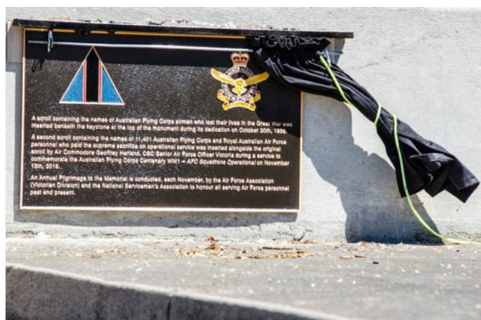
The Commemorative Plaque