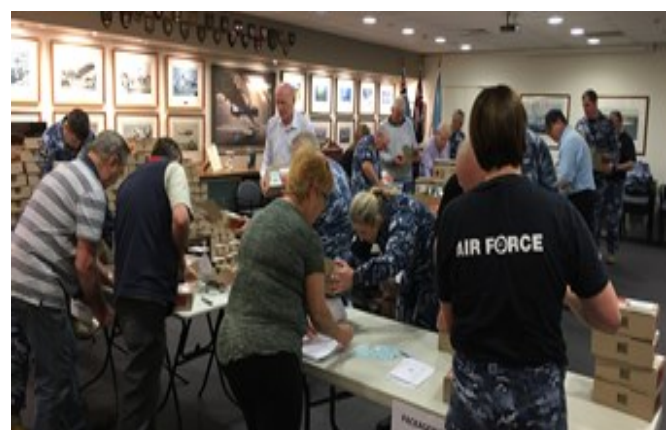
Volunteers hard at work preparing care Parcels for our serving members overseas