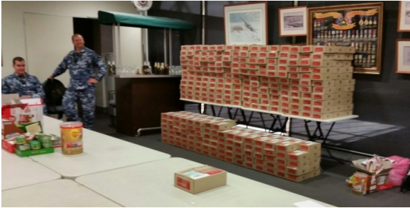
The finished job.

We are enjoying our membership of the AFA and on 9th November we took part in the gift packaging session at AFA HQ where over 700 gift parcels were made up to send to our comrades serving in the Middle East over Christmas. This was a busy but enjoyable session, made easy by the attendance of 17 members of 21 Sqn in addition to representatives from the Victorian branches. What was expected to be an all day job was finished by lunch time and we all enjoyed the excellent lunch arranged for the volunteers