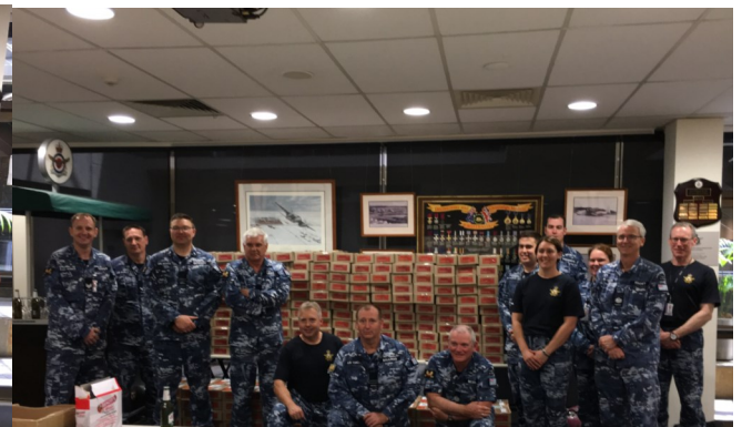
Volunteers from 21 Squadron