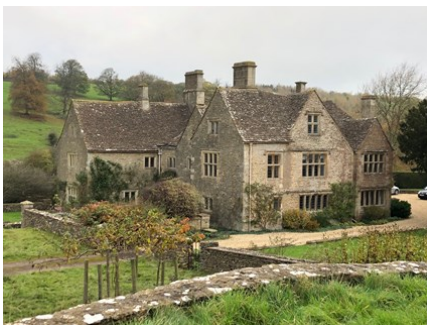
The initial Headquarters of the AFC