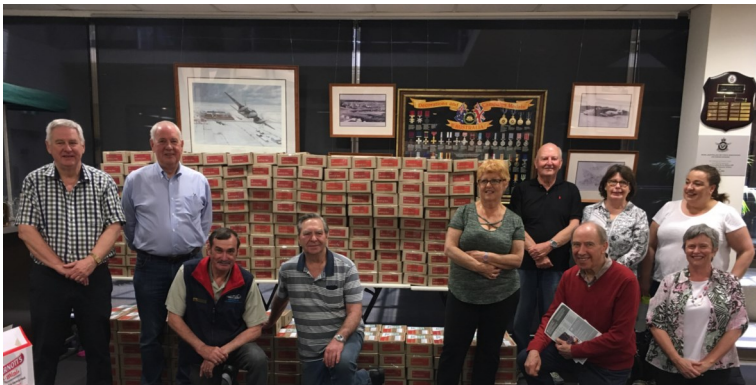
Members and friends involved in packaging.