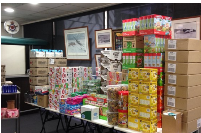
A mountain of goodies to go into the AFA (Victoria) Care Parcels for our serving members overseas