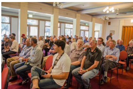
A full house for the 2017 Merz lecture

The Friends of the Museum extended an invitation to all members of the Air Force Association to attend and a generous crowd of 60 guests attended,