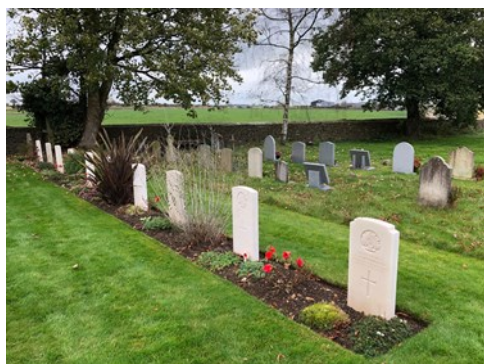
AFC graves at Leighterton

The presentation took place in the town's historic Market House.