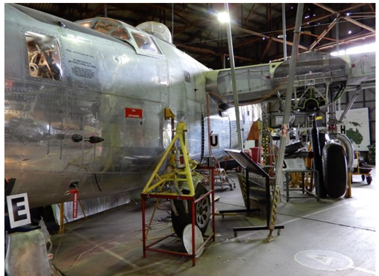
The last B-24 Liberator in the Southern Hemisphere is undergoing intricate restoration work in Werribee.

It's been almost 33 years since the bold vision to restore the B-24 Liberator was taken by the Veterans who served with the aircraft. And now the ambitious project is getting closer to reaching its goal of preserving a B-24 Liberator to honour the contribution of one of the RAAF main bombers in the Pacific of the WW2 era.